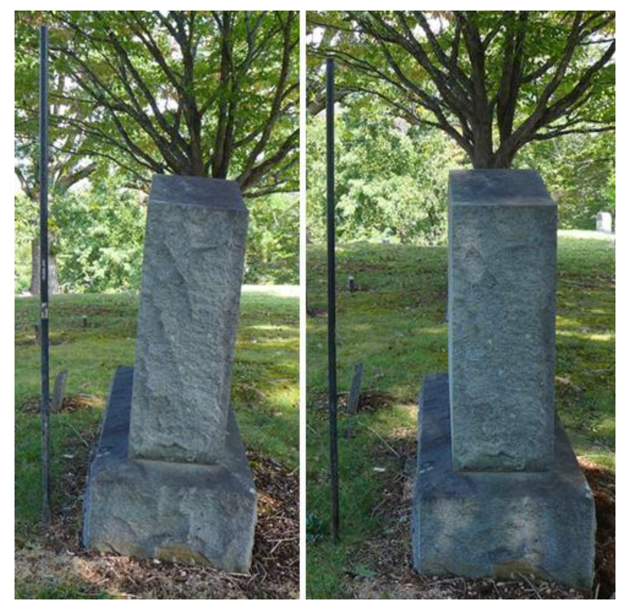
Roane family headstone; the bar is just under 6 ft long. I estimate that the stone, including several inches of base under the surface and concrete under that, weighs 3500 pounds.